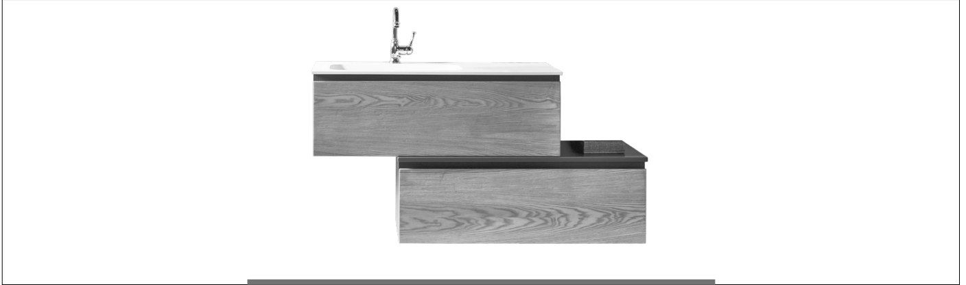
Contemporary - Natura